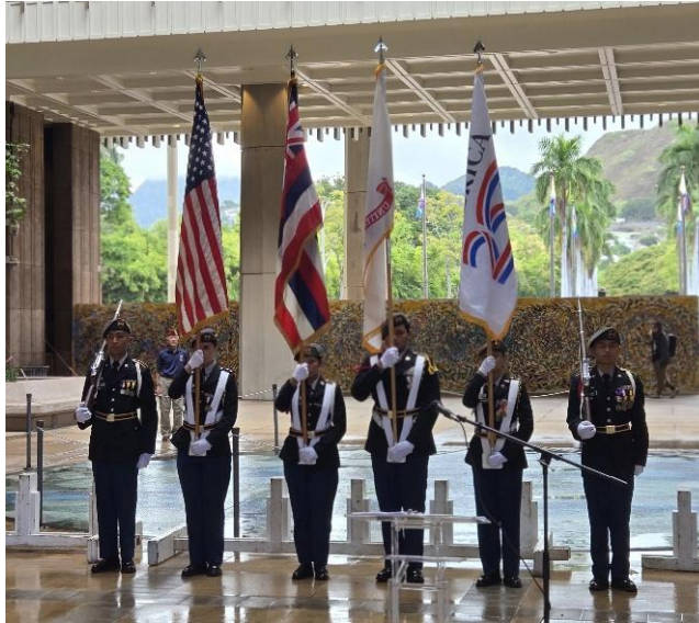
Waipahu High School Army JROTC Color Guard Presentation with America250 Flag at the Hawai'i State Capitol

We reached out and received confirmation that the addition of the America250 flag in ROTC and JROTC Color/Honor Guards is consistent with flag protocol. As noted, College/University and High School presentations would be at sporting events, school/community programs, graduations, and parades, etc.