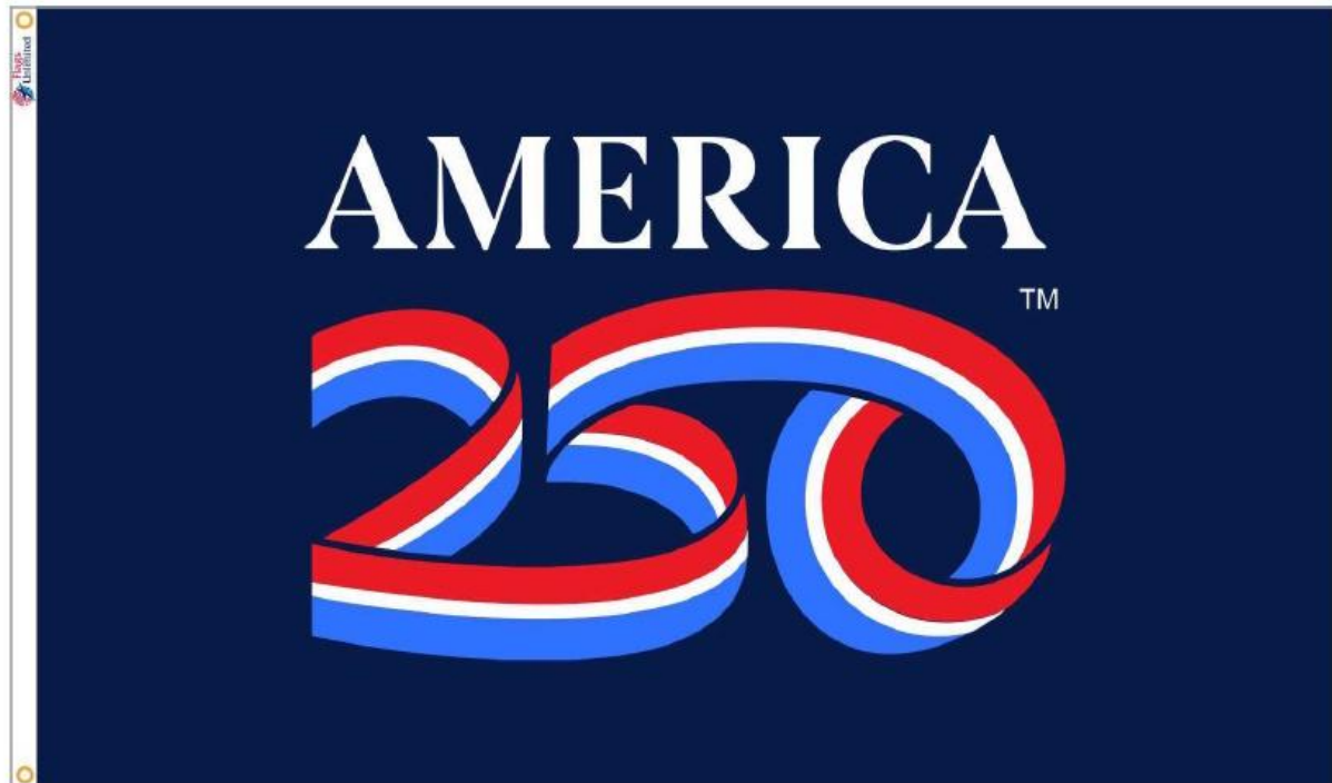
Above is 3'x5' Flag, Blue, Double Sided, with Grommets and no Trim (also available in White)